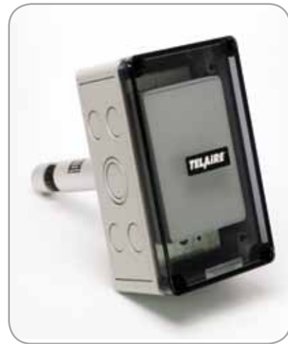
T1508 Aspiration Box for Duct Mounting

The Model 1508 is designed for in-duct sampling of CO 2 concentrations at flow rates greater than 400 fpm. Clear cover allows for observation of the sensor. They will accommodate any of the T5100 series, and can be used for temperature and RH when fitted. Enclosure is screwed to the duct with probe inserted into air stream. Air sampling probe is 1-inch (25.4mm) diameter and 8-inch (203.2mm) long. Enclosure (ABS plastic) has knockouts for conduit connection. Note: Wiring penetrations must be sealed prior to use. CO 2 sensor not included.