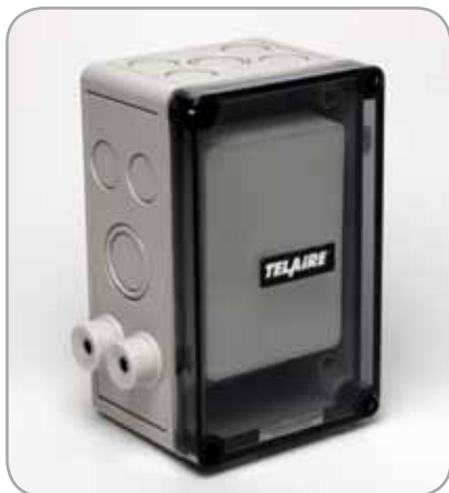
T1505 Splash Resistant Enclosure and T1552 Outside Air Enclosure

The Model 1552 is a rugged weatherproof enclosure (ABS plastic), designed to allow the T5100 series sensor to operate in an outdoor environment and/or where ambient temperatures are below freezing. The 1552 is ideal for monitoring outside air or CO 2 as a surrogate for combustion fumes in parking garages, tunnels and loading docks. This enclosure features a temperature control circuit and internal heaters to maintain the sensor within its normal operating temperature range, even if temperatures outside the enclosure are as low as -20°F (-29°C). Four diffusion ports allow for entry of CO 2 . Response time of the sensor is slowed to approximately 30 minutes to measure a 90% step change in concentrations. Enclosure is designed to screw directly to a wall. CO 2 sensor not included. Power consumption is 24V, 1.5 Amp (max), and includes the T5100 series.